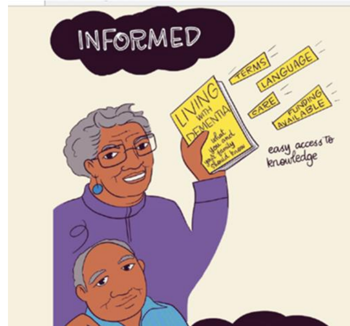
Image by League of Live Illustrators, credit to Rauawaawa Kaumātua Charitable Trust